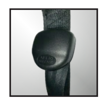
Easy to install and release seat belt adjustment clips. Part Number 900-474